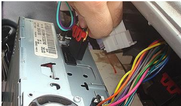
Fig. 4 9-pin plug