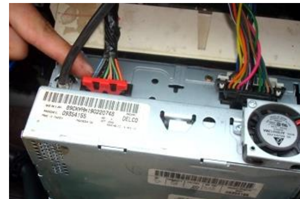
Fig. 2 9-pin plug

Note: If AMFM radio 9-pin socket is empty; do not proceed with install because vehicle does not have required slave unit.