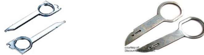
Fig. 1 removal tools