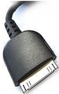
Apple 30-pin dock connector Fig. 4