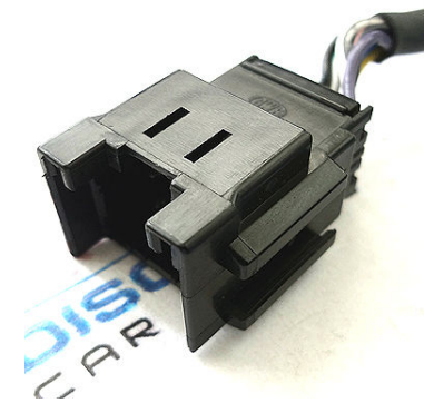
Fig. 3 12-way connector