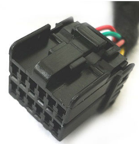
Fig. 1 Ford 12-way plug