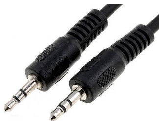
Fig. 6 3.5mm Male audio cable