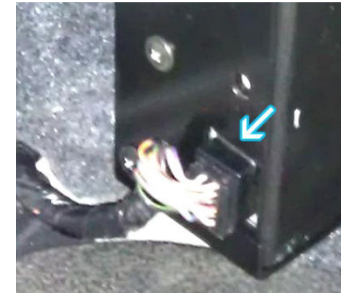
Fig. 2 Ford CD Changer