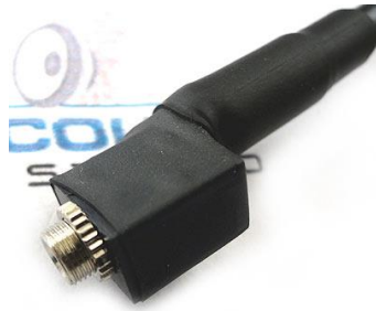
Fig. 3 Audio Jack