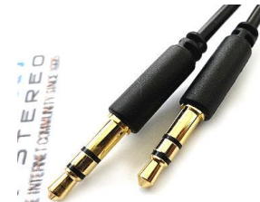
Fig. 5 audio cable (not included)