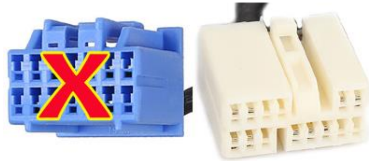
Fig. 1 Honda 14-pin plugs

Warning: Devices with 14-pin blue plug (See Fig. 1) are NOT compatible . The AUX-HOND3 applies to vehicles with 14-pin white plug as seen in Fig. 1