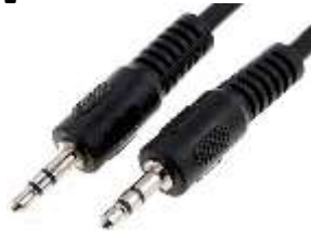
20 ft. audio cable