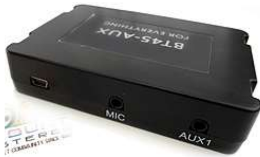
Fig. 11 Module

Note: After initial install, use "AUX2" if engine noise is present during playback.