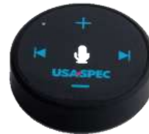
Fig. 20 Wireless remote control