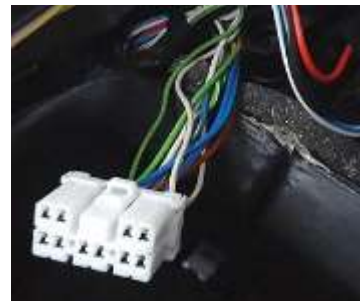
Fig. 18 (10-pin Female plug)