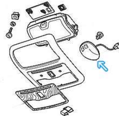
Fig. 12 factory microphone

Note: If vehicle has factory mic in overhead console (See Fig. 12) you may use it instead of mic included with kit. To use factory mic, simply connect 3.5mm plug from installation (See Fig. 15) to module "MIC" input jack (See Fig. 11).