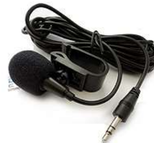
Fig. 13 microphone

To install included microphone (See Fig. 13) simply clip to visor or headliner and carefully route 3.5mm plug down side pillar, under dash and into center armrest. Connect 3.5mm plug to module "MIC" Input jack