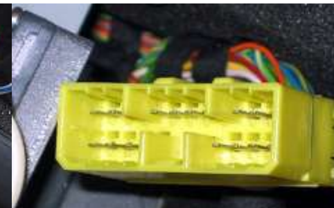
Fig. 19 (18-pin Male connector)

WARNING!! Factory phone plug is required to install this kit. It is vital you provide us the plug/connector size/gender for your vehicle. The plug/connector is located under storage bin. Go to page 5 to learn how to remove storage bin.