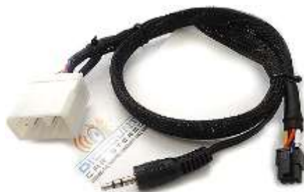
Fig. 15 installation harness (with 10-pin male connector)