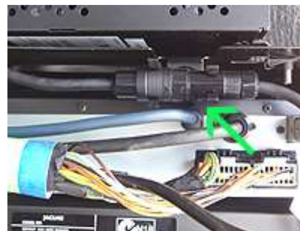
Fig. 1A plug/connector location