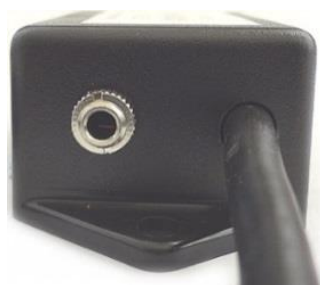
Fig. 4 3.5mm jack