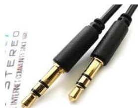
Fig. 3 3 ft. Aux cable