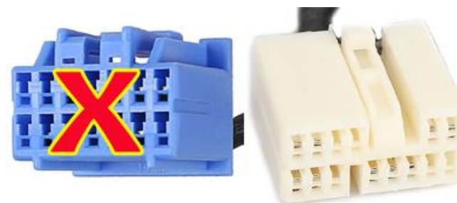
Fig. 2 14-way plugs