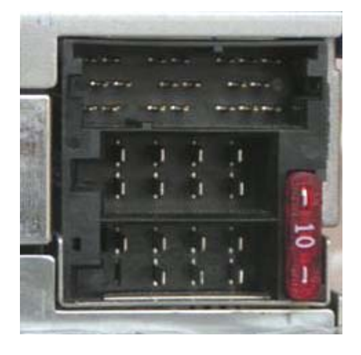
Audi/VW Radio 20/8/8-pin connectors Fig. 6