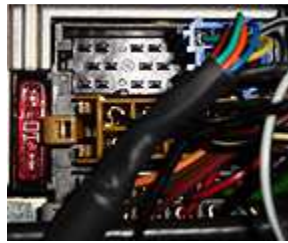
Fig. 2 Blue plug to radio