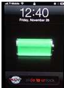
Fig. 4 iPhone Charging