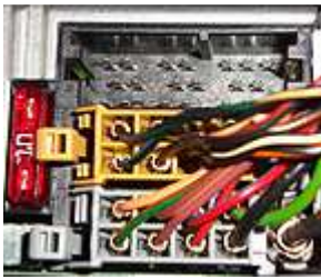
Fig. 1 Radio connectors