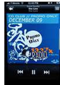
Fig. 6 iPod/iPhone Controls