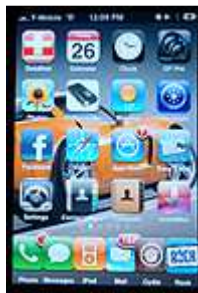
Fig. 5 iPhone Menu