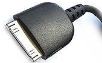
Fig. 2 30-pin dock connector