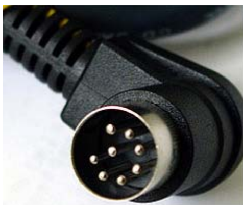
installs with cable facing up.-- ideal for HU-555