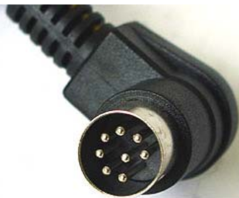
installs with cable facing down