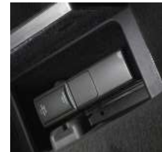
Fig. 2 XM Tuner/6-cd changer