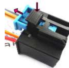
Fig. 1 16-pin plug

To release plug, pull back blue locking tab, press and hold black release tab to slide plug out tuner connector (do not pull wires). (See Fig. 1)