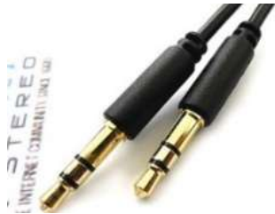
Fig. 4 Audio cable