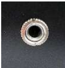
Fig. 5 AUX Jack