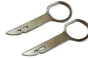
Fig. 1 Radio removal Tools

Remove radio from the dashboard to gain access to the connector. Round edge radios (e.g. RNS, RCD etc.) must disassemble dash for removal and instructions are not part of this guide but available upon request. Square edge Radios (e.g. Premium 6, 7 etc.) require (4) removal tools (See Fig. 1 ) which must be purchased separately.