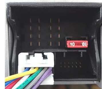
Fig. 3 Radio Connectors