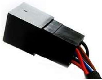
Fig. 4 harness connector