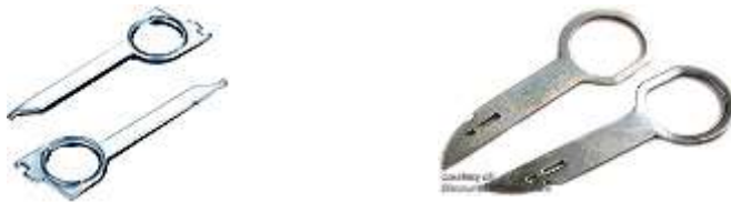
Fig. 1 Radio removal Tools