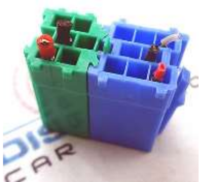
Fig. 5 mating plugs