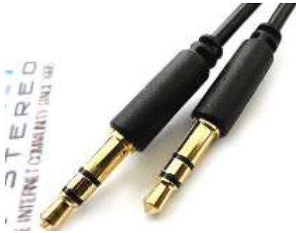
Fig. 8 3.5mm male to male cable