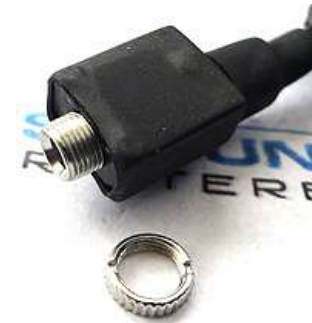
Fig. 6 Audio Jack