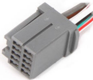
Fig. 1 10-way Plug