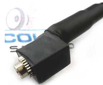
Fig. 4 Audio Jack