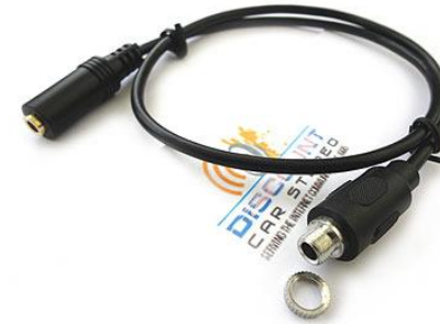
Fig. 4 optional Dash mount cable