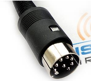
Fig. 2 8-pin plug