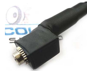
Fig. 3 Audio Jack