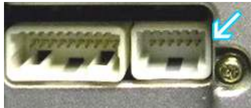
Fig. 2 Radio 12-way connector