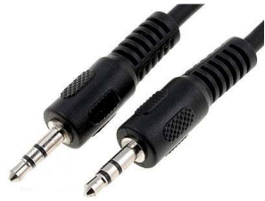
Fig. 6 audio cable