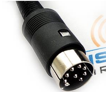
Fig. 1 8-pin plug