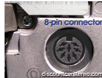
Fig. 2 Radio connector