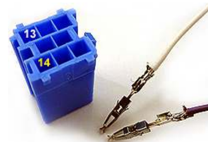
Fig. 3 ISO plug