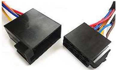
Fig. 5 power harness