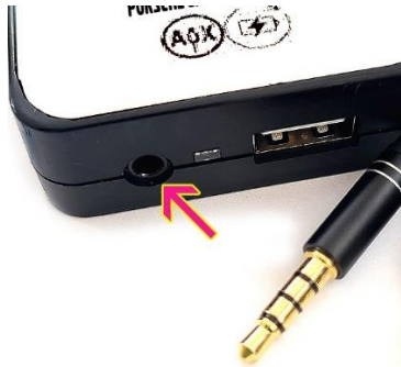
Fig. 4 3.5mm jack