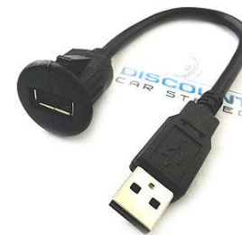
Fig. 8 USB cable