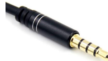
Fig. 3 3 ft. Aux cable