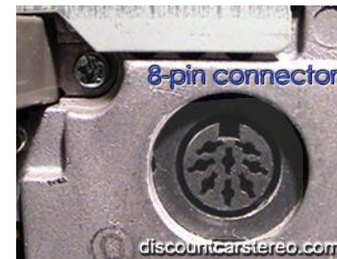
Fig. 2 Radio connector