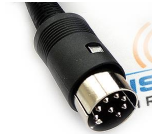
Fig. 1 8-pin plug