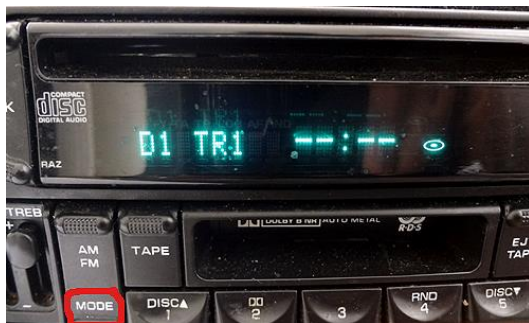
Fig 5 Rounded face radio with Mode button