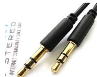
Fig. 3 Audio cable (not included)