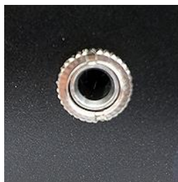
Fig. 4 3.5mm jack