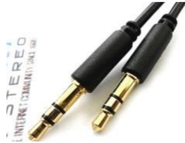
Fig. 3 3 ft. audio cable