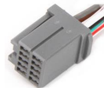
Fig. 1 10-pin plug