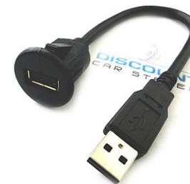
Fig. 8 USB cable