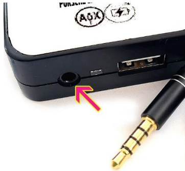
Fig. 4 3.5mm jack