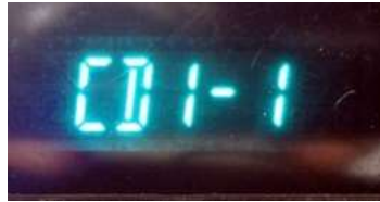
Fig. 3 Changer mode

Note: If radio does not switch to CD, cycle ignition OFF/ON and try again.