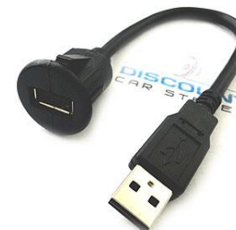
Fig. 8 USB cable