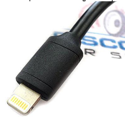
Fig. 11 Lightning plug