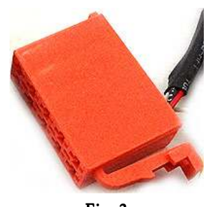
Fig. 3 10-way plug

With radio removed , connect the 10-way plug from adapter harness (See Fig. 3) into the (C) slot on Radio (See Fig. 4)