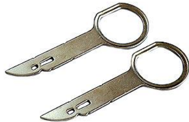
Fig. 1 removal tools