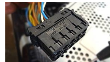
Fig. 3 CD Changer plug