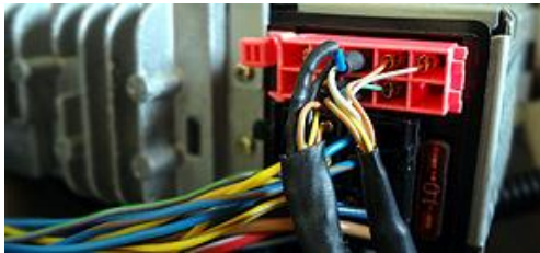
Fig. 6 10-pin Adapter plug