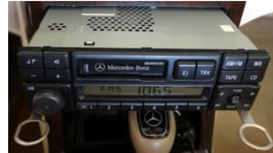
Fig. 2 Mercedes Radio