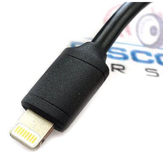
Fig. 7 Lightning Plug