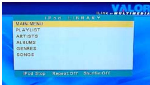
Example of iPod library screen

You can enjoy iTunes™, music, which is downloaded from Apple™, iTunes™, in iPod mode.