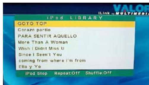
Example of playlist screen