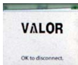
Example of iPod screen