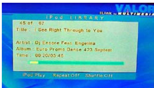
Example of playback screen