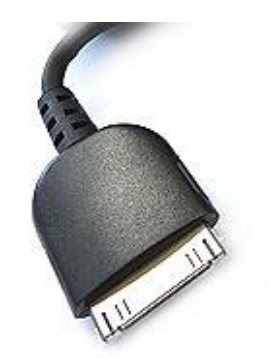
Apple 30-pin dock connector Fig. 4