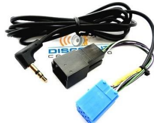
Fig. 5 3.5-BKRCD