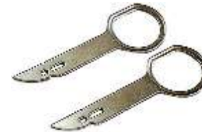
Fig. 2 Radio removal Tools