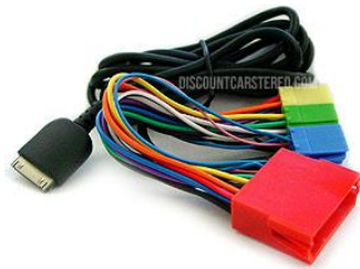
Fig. 4 iP-BKRCD