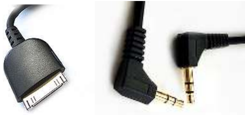
Fig.5 30-pin dock/3.5mm jack