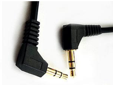
Fig.5 30-pin dock/3.5mm jack