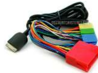
Fig. 3, iP-BKRCD