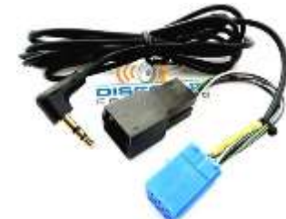
Fig. 4 3.5-BKRCD