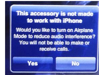
Fig. 9 iPhone default message