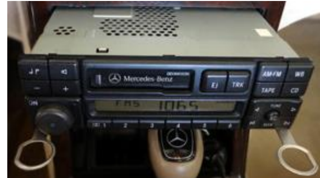
Fig. 2 Mercedes radio