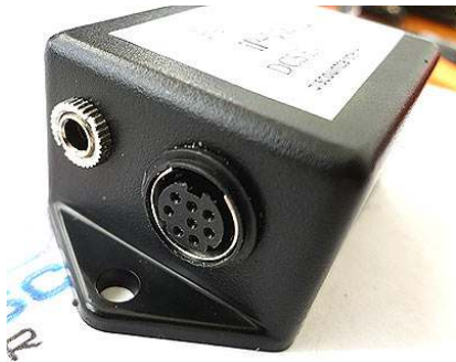
Fig. 5 adapter inputs