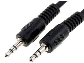
Fig. 6 3.5mm audio cable