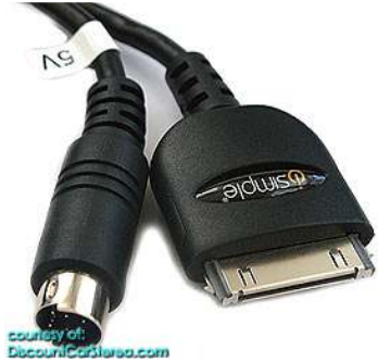
Fig. 4 30-pin dock cable