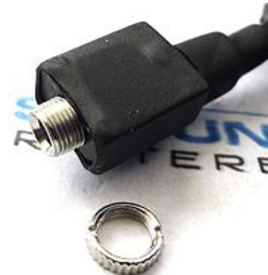
Fig. 5 Audio Jack