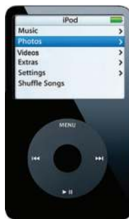
MP3 Player (not included)