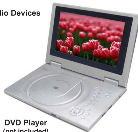
DVD Player (not included)