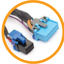
Vehicle Specific Harness (actual harness may vary)