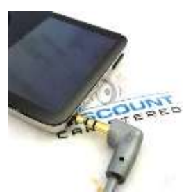
Fig. 6 3.5mm plug

4. Search audio device for a test tack and press play. Music from Audio device will play on car speakers.