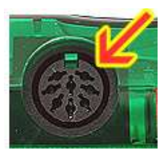
Fig. 6 8-pin DIN input

Route the 3.5mm plug toward the dash or location where audio device will reside (within 6 ft.)