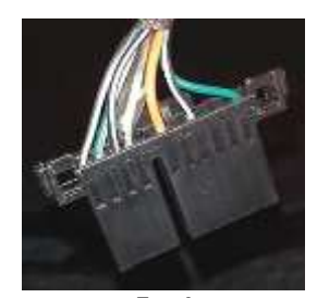
Fig. 1 Factory Changer Plug