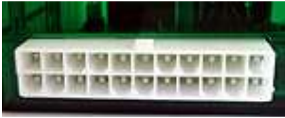
Fig. 4 22-way Molex connector