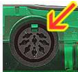
Fig. 7 8-pin DIN input