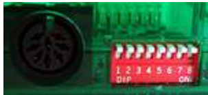
Fig. 5 dip-switches