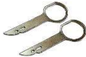
Fig. 1 Radio Removal Tool