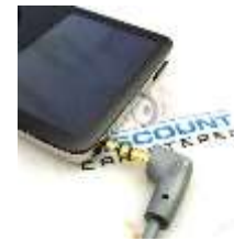
Fig. 8 3.5mm plug