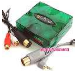
Fig. 6 audio cables