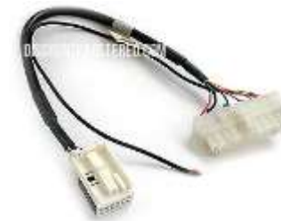
Fig. 3 Adapter 12-way plug